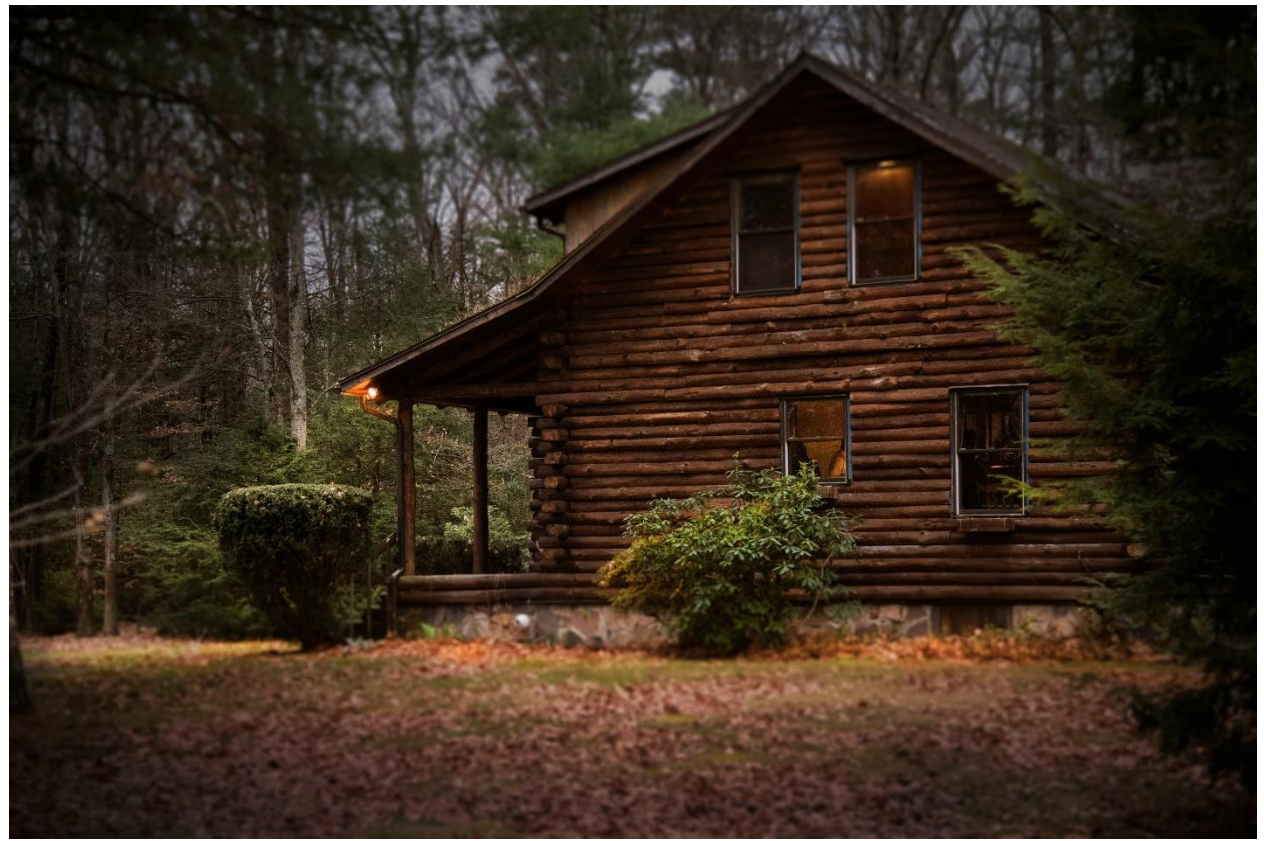
EVERY SUMMER AND WINTER THEY WOULD GO TO SEE THEIR FAMILY IN LEBANON. THEY LOVED MUSIC SO THEY WOULD ALWAYS WRITE SONGS. WHILE ONE OF THEM LOVED DANCING TO POP THE OTHER ONE WAS THE COMPLETE OPPOSITE! SHE LOVED TO LISTEN TO CALM AND SOOTHING MUSIC. AND IN THEIR FREE TIME THEY WOULD CALL THEIR FAMILY AND TALK ABOUT THEIR CURRENT LIVES AND IT WAS THEIR FAVOURITE TIME OF THE WEEK BECAUSE THEY LIVED IN A SMALL CABIN IN THE FOREST WITH NO SERVICE AND THEY COULD ONLY AFFORD TO PAY FOR ONE DAY A WEEK.ONE OF THEM WAS ALWAYS LAYING ON THE COUCH WATCHING TELEVISION AND EATING SNACKS ALL THE TIME WHILE THE OTHER ONE WAS HARD WORKING. WHENEVER THEY FIGHT WHICH WASN'T A COMMON THING THAT THEY WOULD DO THEY WOULD ALWAYS FIND A SOLUTION TO MAKE UP AND WHEN ONE OF THEM IS SAD THE OTHER ONE COMFORTS HER. AND THEY ALWAYS STAY BY EACHOTHERS SIDE. ONE DAY THE GIRLS DECIDED TO GO ON A NATURE WALK WHEN SUDDENLY A LITTLE BEAR JUMPED INFRONT OF THEM, THE FIRST GIRL SCREAMED WHILE THE OTHER ONE LEPT AT IT AND KILLED IT AND THEN THEY BOTH STARTED RUNNING AWAY BUT WHEN THE GIRLS STOP TO TAKE A BREATH ONE OF THE GIRLS SAID IN A LOW VOICE DON'T MOVE AND THEN THE OTHER GIRL LOOKED UP TO SEE THE MOTHER OF THE BEAR THEY KILLED BUT THEN THEY SEE AN ABANDONED BABY BEAR, GRAB IT AND GIVE IT TO THE MAMA BEAR.

THERE WAS ONCE TWO COUSINS WHO LIVED IN A SMALL TOWN FAR AWAY FROM THEIR FAMILY. THEY WOULD ALWAYS CRY ABOUT IT BUT NOW THEY'VE LEARNED TO BE STRONG AND AT LEAST THEY HAD EACH OTHER THEY WOULD ALWAYS SAY. THEY WERE BUSY WITH SCHOOL SO TIME FLEW BY FAST.